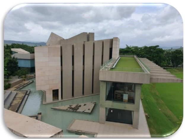
Overview Of Library Building