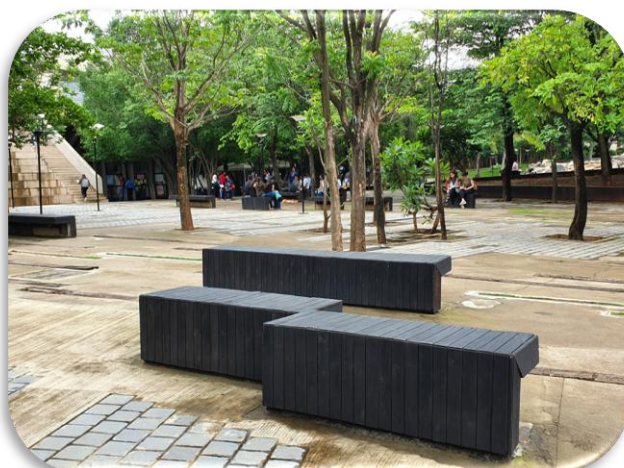
Interactive Seating in front of Library

FLAME University is a private university, with 31 institutional and administrative buildings, including a sports complex, amphitheater. The campus is vibrant with four cafes and three water bodies. It is spread on 53 acres of green expanse.