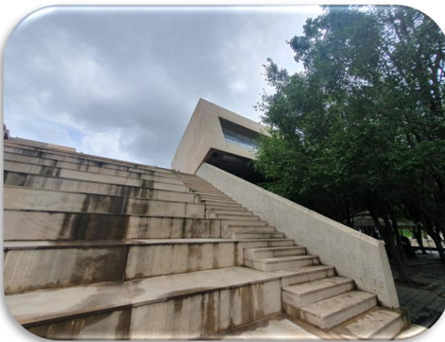
Informal Gathering Spaces for Students

The 60-acre campus of FLAME University is in Pune, Maharashtra. The campus has been designed by Vastu Shilpa Consultants, an architectural practice founded by 2018 Pritzker Laureate B.V. Doshi.